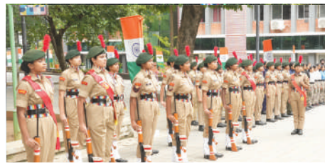
National Cadet Corps (NCC)