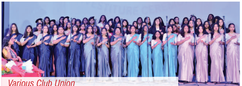
Various Club Union