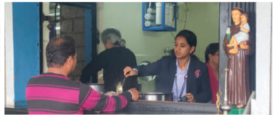
All India Catholic University Federation (AICUF)