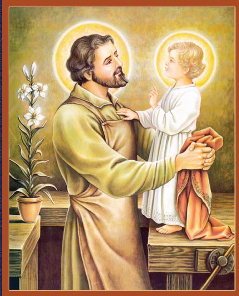
The Patron of the Sisters of St. Joseph of Tarbes