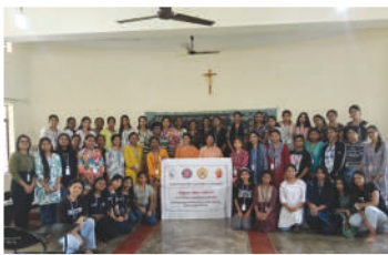
National Service Scheme (NSS)