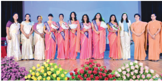
College Student Union